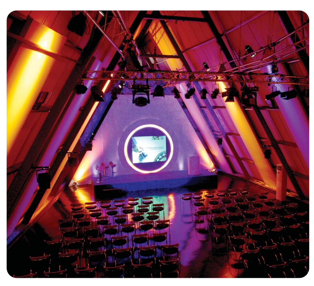
▲ ATA Product launch